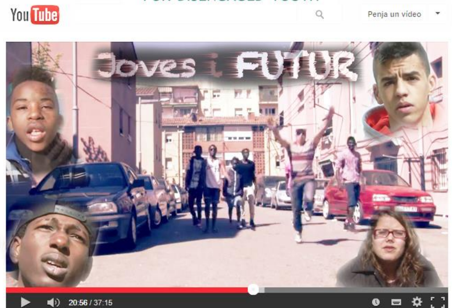
Experience the direct voices of the young people on