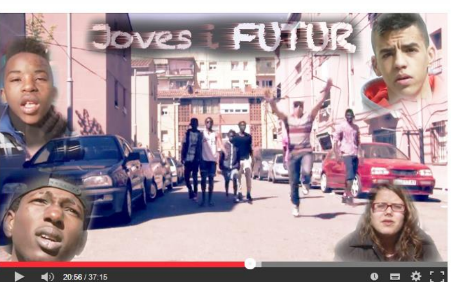
Experience the direct voices of the young people on